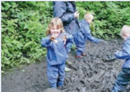
Walkergate children encountering mud at the countryside centre