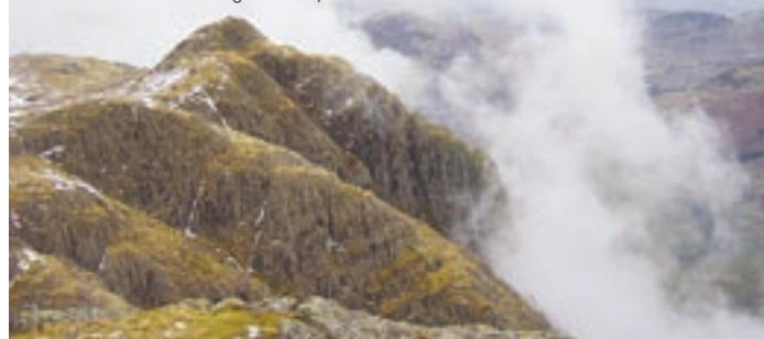
An ancestral view down Langdale Valley

This awareness of material and the sense of the importance of connection with the stuff of life is found in Steiner Kindergartens, but I'm not talking about 'doing Steiner', just the importance, potential and richness of making way for all this wonderful primary and real material from which imagination springs.