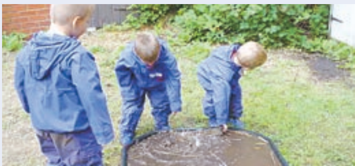
Re-encountering mud back at nursery

Back at nursery, lucky children, they explore again inside and outside with clay, soil, compost, in the natural and vibrant ways of exploration and exchange they'd naturally moved with in the woods.