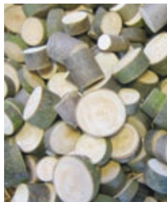
Hazel material ready for exploration at South Tyneside Early Excellence Centre

For building and construction areas why not use blocks from seasoned birch, hazel, beech, with stones of beautiful shades and varieties; for pattern-making and arranging, feathers, shells, stones, pebbles, beachcombed glass?